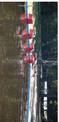
Our swim team welcomes all levels

Guests welcome (daily fee) Safe environment Pavilion and picnic area